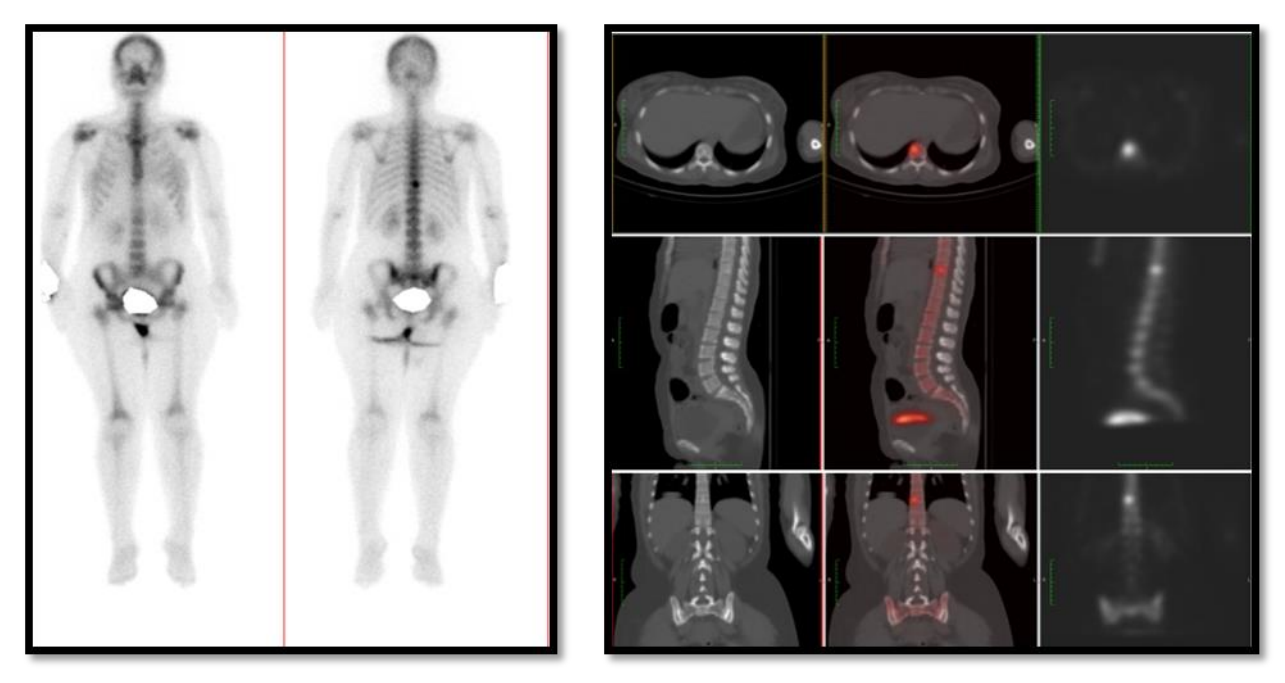
Figure (2) : 29-year-old female patient with newly diagnosed left breast cancer not operated referred for metastatic work-up. Bone scan revealed solitary equivocal osseous lesion at the 9th dorsal vertebra with score (3) "Equivocal". SPECT/CT images showed solitary osseous lesion at DV9 with underlying sclerotic lesion in low dose CT images, score (5) "Malignant".

Figure (1): 35-year-old female patient with newly diagnosed right breast cancer not operated referred for staging. Bone scan revealed solitary equivocal osseous lesion at the lower part of the sternum with score (3) "Equivocal". SPECT/CT images showed solitary osseous lesion at the sternum with underlying lytic lesion in low dose CT images, score (5) "Malignant".